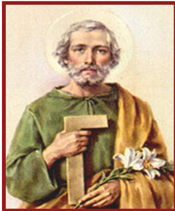
St Joseph the Patriarch Queen of Angels St Joseph the Worker Pray for us!